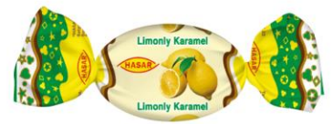
"Lemon" fruit filled candy