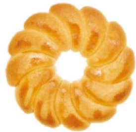
"Alem" shortbread cookies