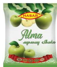
"Apple" apple flavored marmalade sprinkled with sugar (300g)