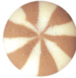
"Lezzet" chocolate filled cream flavored butter cookies