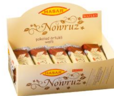
"Nowruz" glazed wafers with baked milk flavor (840g)