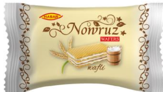
"Nowruz" wafers with baked milk flavor