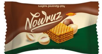
"Nowruz" wafers with hazelnut flavor