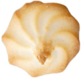
"Tolkun" cream flavored butter cookies