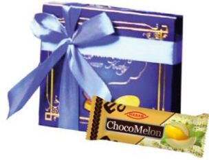
"Chocomelon" sun-dried melon filled glazed sweets (200g)