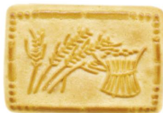
"Summul" shortbread cookies