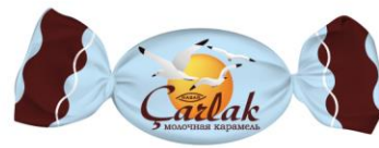
"Charlak" filled milk candy