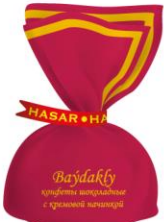
"Baydakly" milk flavored cream filled chocolate sweets