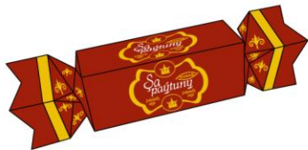
"Sha paytuny" cream filled chocolate sweets (240g)