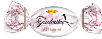
"Garlavach" filled milk candy