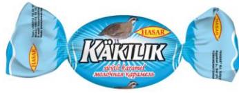
"Kakilik" filled milk candy