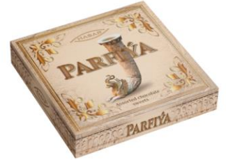
"Parthia" assorted chocolate sweets (185g)