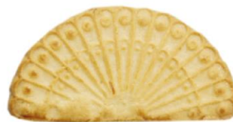
"Tawus" shortbread cookies