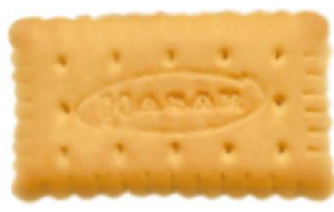
"Shanly" shortbread cookies