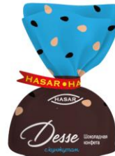
"Desse" sesame and cream filled chocolate sweets