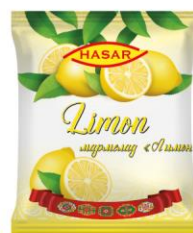
"Lemon" lemon flavored marmalade sprinkled with sugar (300g)