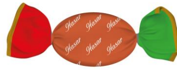
"Orange" filled hard candy