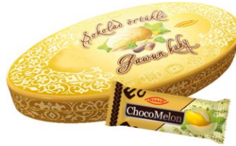
"Chocomelon" sun-dried melon filled glazed sweets (400g)