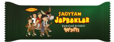
"Funny Japbacks" wafers in chocolate glaze