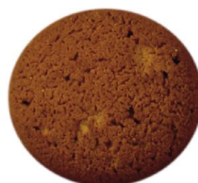
"Nazli" chocolate flavored grain cookies