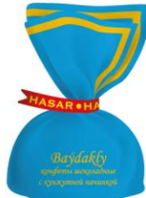
"Baydakly" sesame and cream filled chocolate sweets