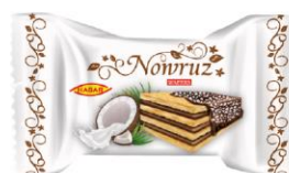
"Nowruz" glazed wafers with coconut flakes