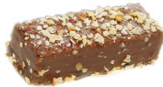
Glazed wafers chocolate and vanilla flavors sprinkled with peanuts