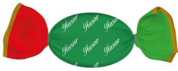
"Mint" filled hard candy