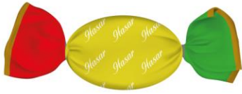
"Dyushes" filled hard candy