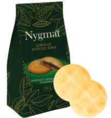
"Nygmat" chocolate filled cream flavored butter cookies (180g)