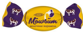
"Movsum" filled milk candy