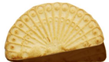
"Tawus" glazed shortbread cookies