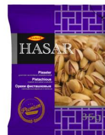
Salted and roasted pistachious (35g)