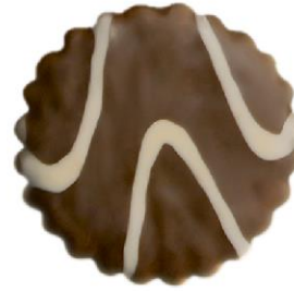
"Petir" glazed shortbread cookies