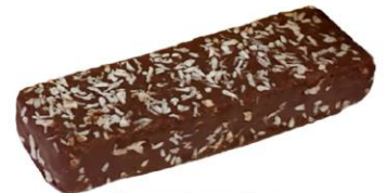
Glazed wafers chocolate and vanilla flavors sprinkled with coconut flakes