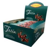
"Tasin" peanut filled glazed sweets (720g)