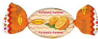
"Orange" fruit filled candy