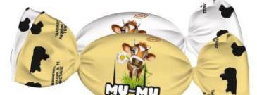
"Mu-mu" filled milk candy