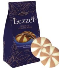
"Lezzet" chocolate filled cream flavored butter cookies (180g)