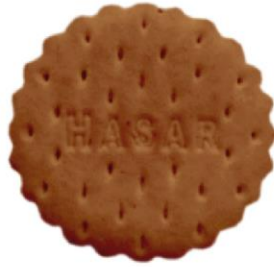
"Petir" cocoa flavored shortbread cookies