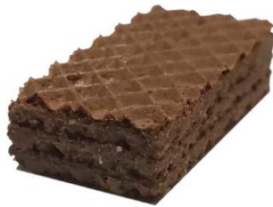
"Crispy" wafers with chocolate flavor