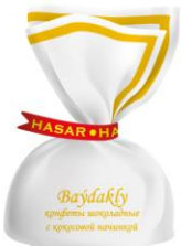
"Baydakly" coconut and cream filled chocolate sweets