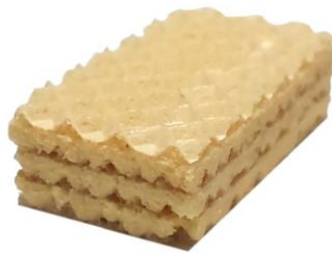
"Lemon" wafers with lemon flavor