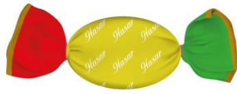
"Lemon" filled hard candy