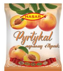
"Peach" peach marmalade sprinkled with sugar (300g)