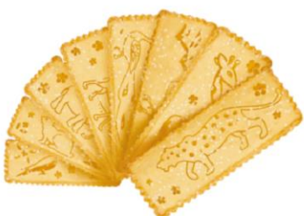
"Bathyz" shortbread cookies sprinkled with sugar