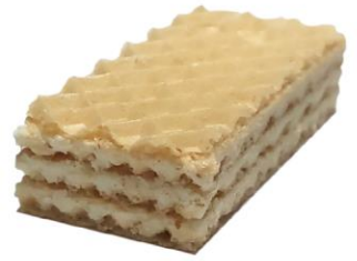
"Vanilla" wafers with plombir flavor