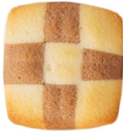
"Horjun" cream flavored butter cookies