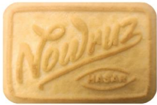
"Nowruz" shortbread cookies