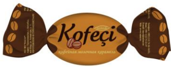
"Kofechi" coffee flavored filled milk candy