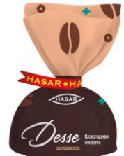
"Desse" "Espresso" flavored cream filled chocolate sweets