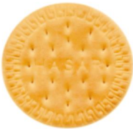
"Gunesh" shortbread cookies