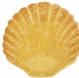
"Shohle" shortbread cookies sprinkled with sugar