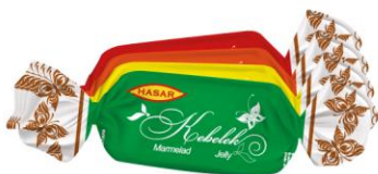
"Kebelek" fruit flavored assorted marmalade sprinkled with sugar