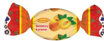
"Peach" fruit filled candy