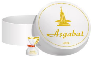
"Ashgabat" coconut and cream filled chocolate sweets (180g)