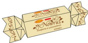
"Nowruz" condensed milk flavored glazed marmalade (240g)