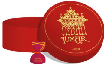
"Tumar" milk flavored cream filled chocolate sweets (180g)