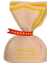
"Baydakly" "Espresso" flavored cream filled chocolate sweets