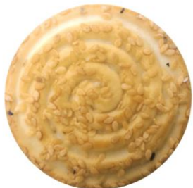
"Aylar" shortbread cookies sprinkled with sesame