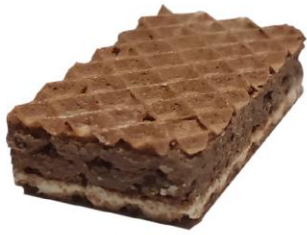
"Dostluk" wafers with chocolate and plombir flavor