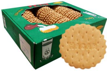
"Petir" shortbread cookies