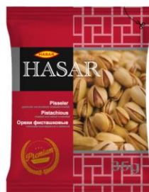
Salted and roasted pistachious (35g)