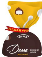
"Desse" milk flavored cream filled chocolate sweets