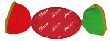
"Barberry" filled hard candy