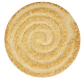
"Aylar" shortbread cookies sprinkled with sugar