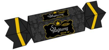
"Sha paytuny" chocolate filled chocolate sweets (240g)