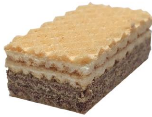
"Yashlyk" wafers with chocolate and plombir flavor