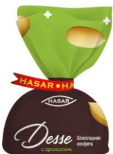
"Desse" peanut and cream filled chocolate sweets