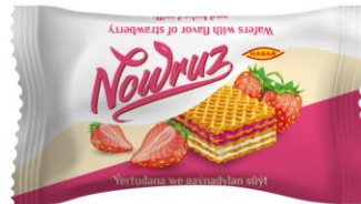
"Nowruz" wafers with baked milk and strawberry flavor