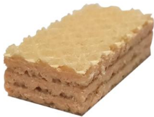
"Orange" wafers with orange flavor