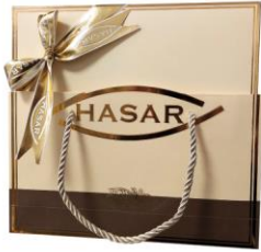
Assorted chocolate sweets with bitter almond and cherry flavor (185g)