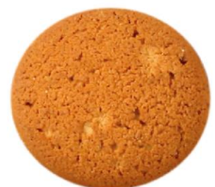
"Sule" oatmeal cookies