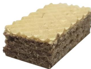
"Delicate" wafers with chocolate flavor