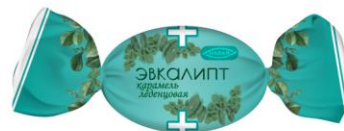
"Equalipt" filled hard candy