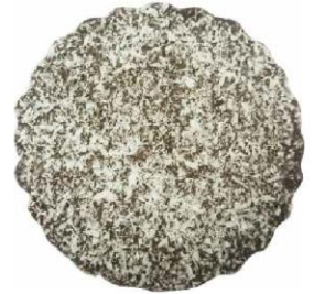
"Petir" glazed shortbread cookies sprinkled with coconut flakes