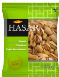
Salted and roasted pistachious (35g)