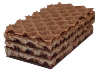
"Novelty" wafers with plombir flavor