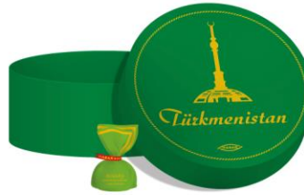
"Turkmenistan" peanut and cream filled chocolate sweets (180g)