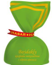
"Baydakly" peanut and cream filled chocolate sweets